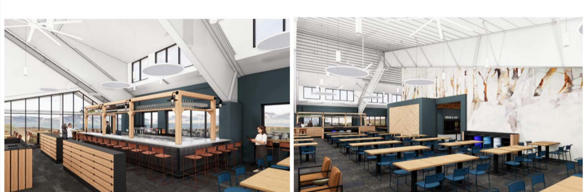
Preliminary Renderings. Subject to Change.

And we are thrilled to give you a peek here of the interior designs.