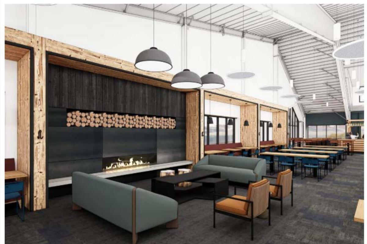
Preliminary Renderings. Subject to Change.

The Shavers Center will be available for private rentals starting May 2026, with both indoor and outdoor patio space for up to 375 guests. New amenities such as state-of-the-art acoustics, A/V, staging, and lighting, all paired with the spectacular views from 4848' will make your next event one for the books.